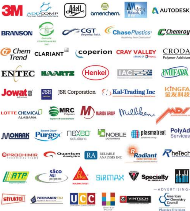
EXHIBIT & SPONSORSHIP OPPORTUNITIES